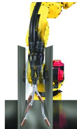
Confined Linear Welding