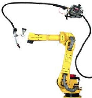
2) Remove Standard Torch