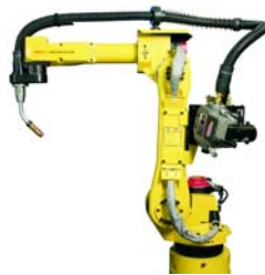
4) Integrated Dress-out Package