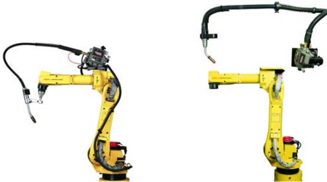
1) Standard Torch Configuration